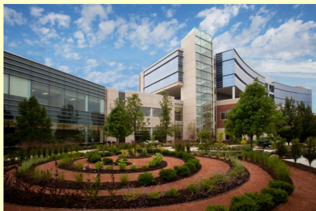
On Left: Healing Gardens