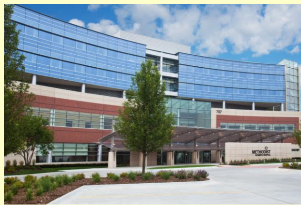
On Right: Main Entrance